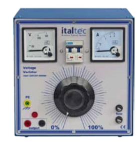
Mod.4180-ALIM For excitation of brake Mod.4180. Input: 220/230Vac Output: 0÷220Vdc