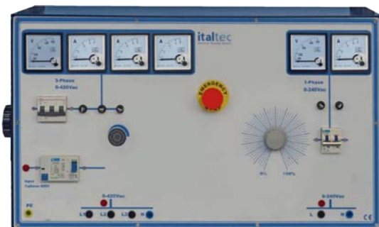
Mod.4002-6-6 -3-Ph AC power supply 6+6A

3 phase adjustable output: 0÷440V, 6A with - 1 x A.C. voltmeter - 3 x A.C. ammeters