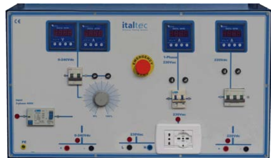
Mod.4004D -DC power supply (Digital)