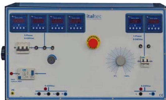
Mod.4002D 3-Ph/1Ph AC power supply(Digital)

Single phase triple output: fixed 230Vac 16A - 1 x A.C. ammeter