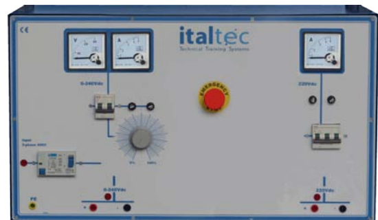
Mod.4004-3-5 -DC power supply

Single phase adjustable output: 0÷250V 6A with - 1 x A.C. voltmeter - 1 x A.C. ammeter