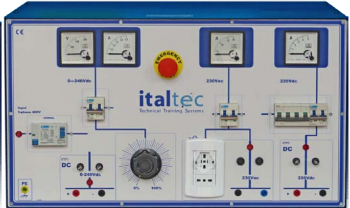
Mod.3004 DC power supply 2+3A

General protection with high sensitivity magneto thermal differential (0,03A) automatic circuit breaker. Mushroom emergency push -button All outputs are protected by means of an automatic magneto thermal circuit breaker and fuses. Adjustable 3Ph motor overload protection. Dimensions: 2x 70x40x40h(cm)